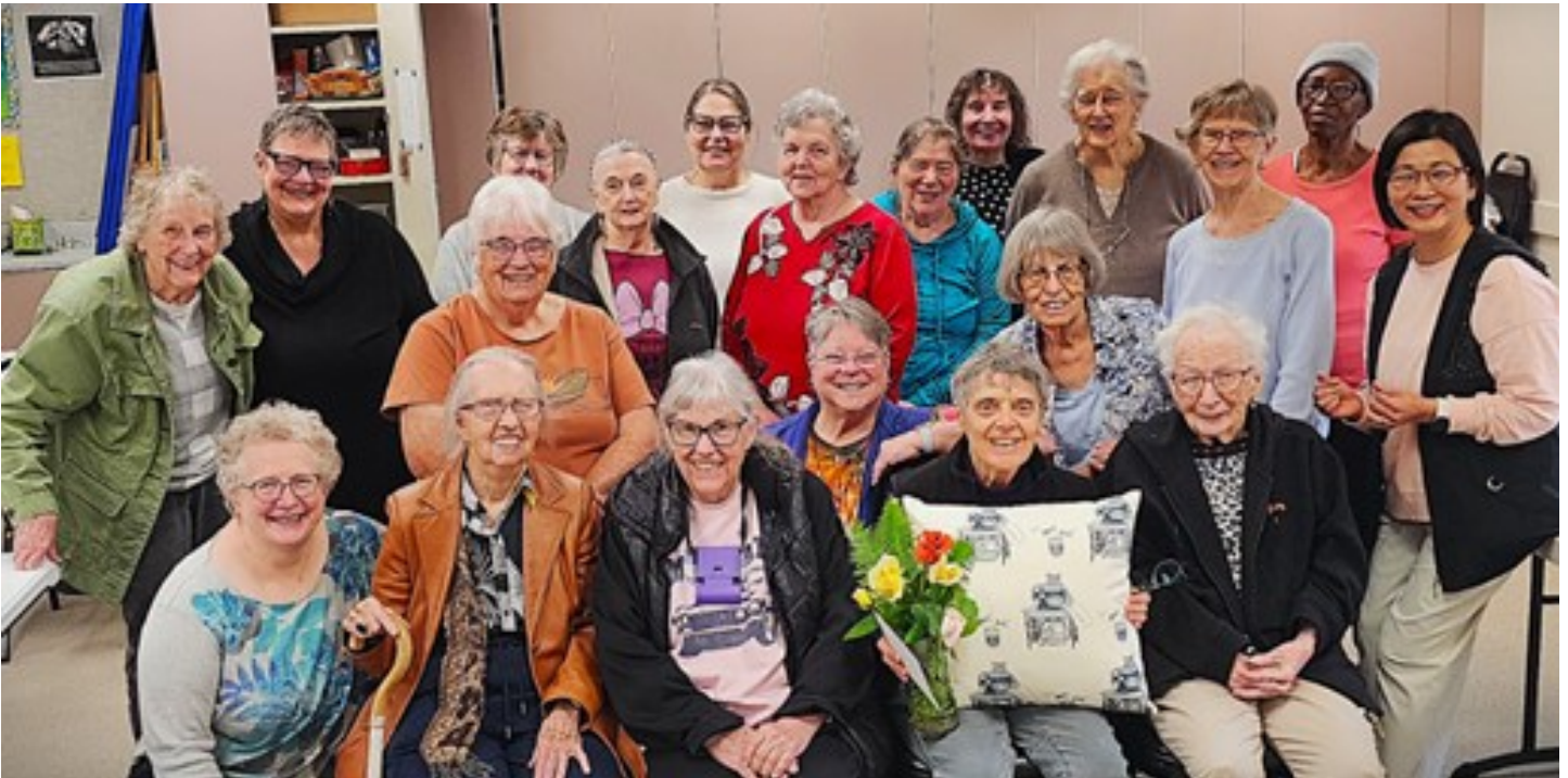
Shoreline Senior Center Quilters and Sewers: Sew Much Fun, Sew Little Time!